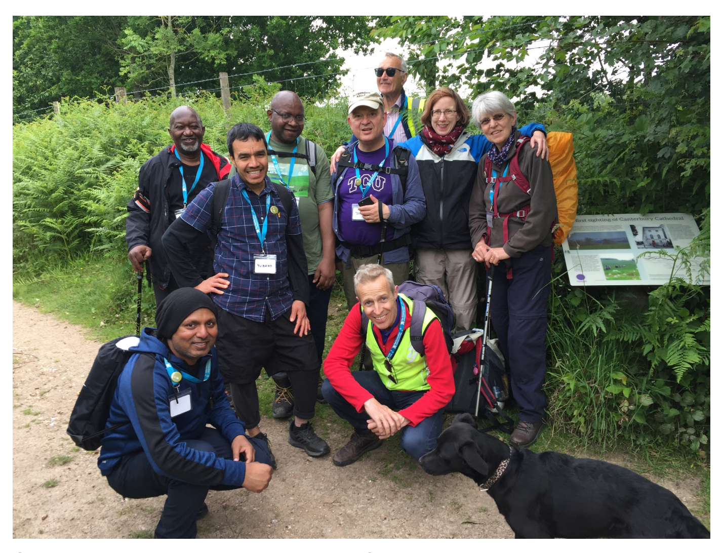
St Martin-in-the-Fields pilgrimage to Canterbury, June 2022

© The Archbishops' Council 2000. Hymns using CCL 284612 and Calamus 1744. Music using MRL 811779.